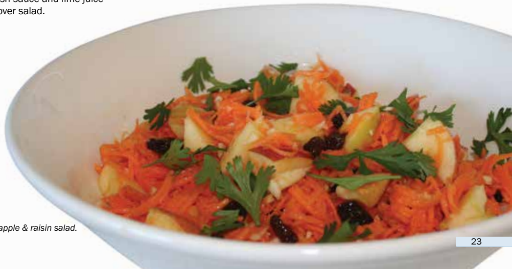
Thai spicy carrot, apple & raisin salad.

Method: Grill corn on high setting for 5-6 minutes rotating until slightly charred. Slice kernels from the cob and combine with sliced onions, celery, tomatoes and avocado. Blend olive oil, vinegar, curry power and salt and pour over salad greens.