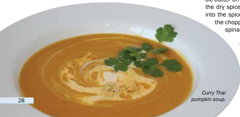
Curry Thai pumpkin soup.

Method: Chop pumpkin into 1-inch cubes and boil until soft. Drain mash and set aside. Melt butter, stirring in dried herbs and spices and sauté for 1 minute. Stir in garlic, curry paste and coconut milk. Finally add the pumpkin and allow to simmer, stirring gently. Blend the soup in a blender until smooth and creamy. Serve with fresh cilantro.