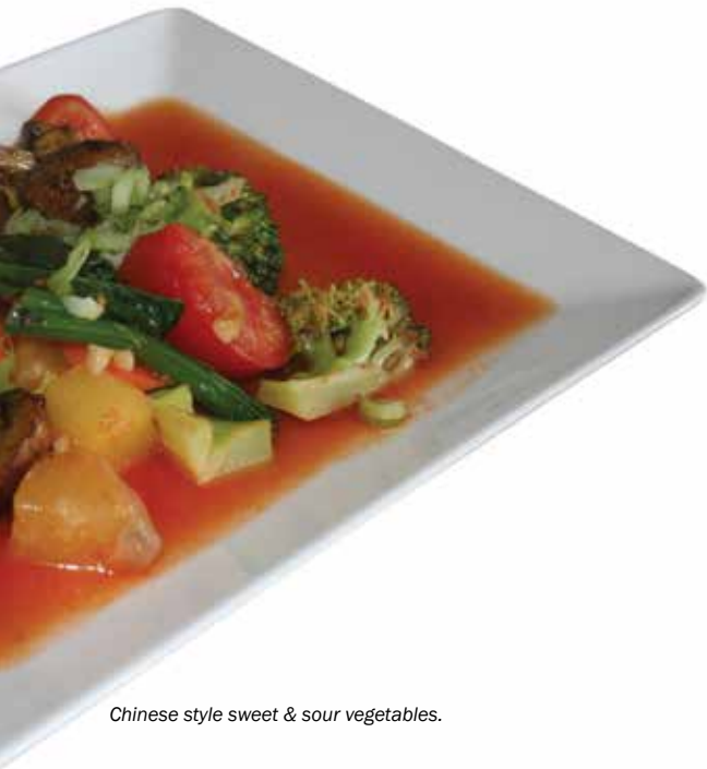
Chinese style sweet & sour vegetables.