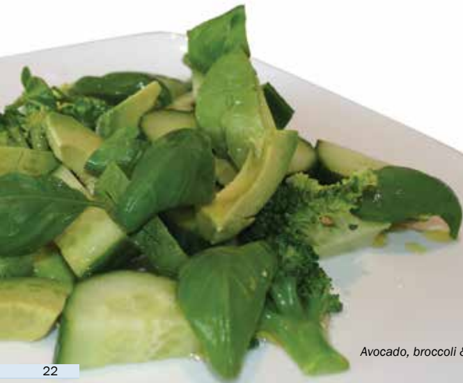
Avocado, broccoli & cucumber salad.

Method: Scrub and boil the beetroot until still a little crunchy. Dice into cubes. Add and combine all the other ingredients.