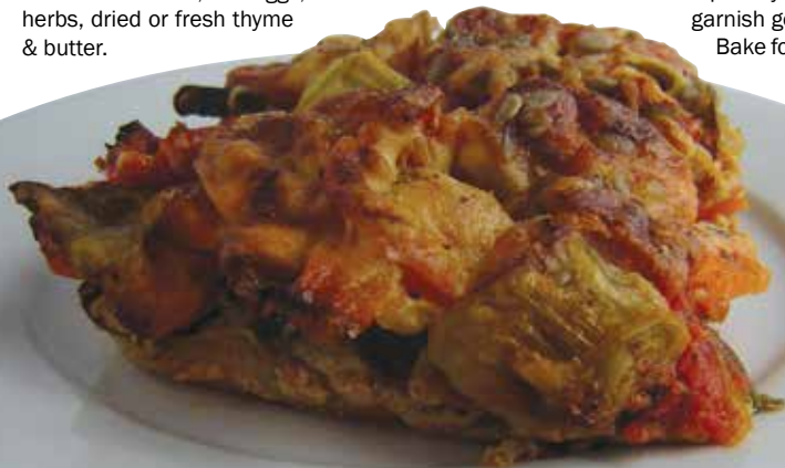
Eggplant, leek & zucchini bake.

Ingredients: Serves 4. 1 cup of quinoa, 4 medium green or red bell peppers (capsicum) 1 per person, tops cut off and seeds removed, 2 cup vegetable stock (from homemade soup), 1 tsp dill seed, 2 diced green apples, 1 cup chopped celery, 1