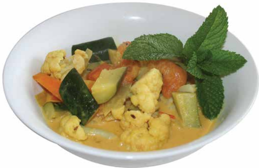
Indian style zucchini & cauliflower curry.