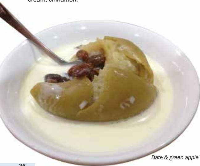
Date & green apple dessert.

Ingredients: 1 large green apple (or red if you prefer), 6-8 dates, a dessertspoon each of raisins, cranberries or currants, cream, cinnamon.