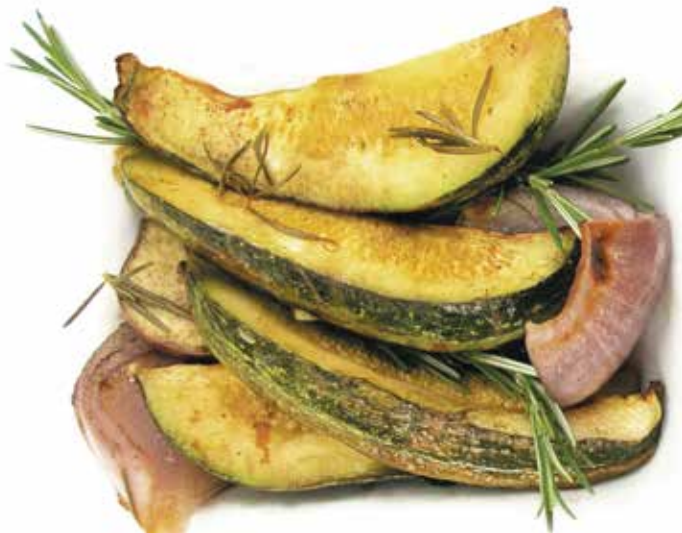
Roast vegetable feast.

Method: Heat oven to 175°C Take generous portions of all the vegetables and cut into similar bite sized wedges. Cook the sweet potato, pumpkin, carrots, onion, garlic and parsnip for 45 minutes in a drizzle of olive oil, stirring every 15 minutes.